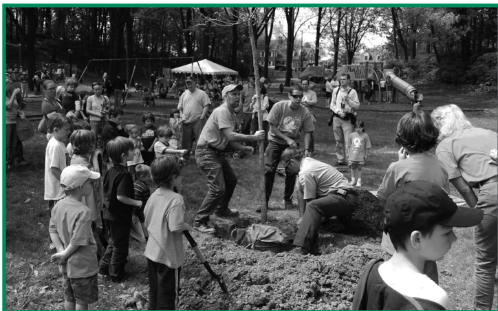
Earth Day Fair 2010

Christmas Trees will be collected by the Borough and recycled from Monday, Jan. 3rd through Monday Jan. 17th, 2011. There will be no additional pick-ups after January 17th! Please place trees where normal refuse and recycling are collected.