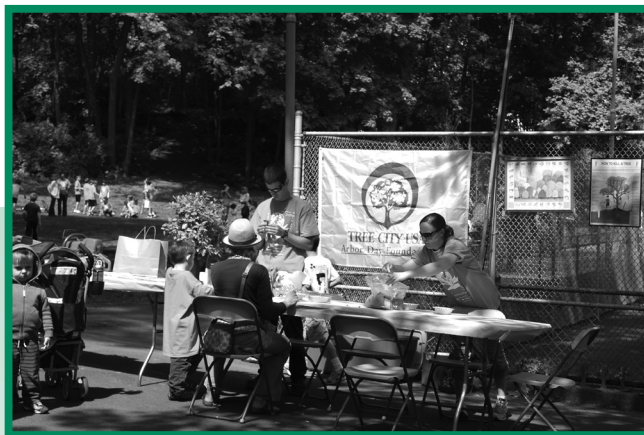
The 3rd Earth Day was a great success and this one should be even better!

Also, that same morning, from 8 a.m. to 10 a.m. we are looking for volunteers to help clean up Happy Hollow playground as well as the other playgrounds if there is enough interest. Please call Wyomissing Borough Hall at 610-376-7481 if you would like to volunteer to help plan and carry out this exciting Borough event and/or to help with the clean up that morning. Our Earth Day Committee will begin meeting in January and we would love some new members and ideas!